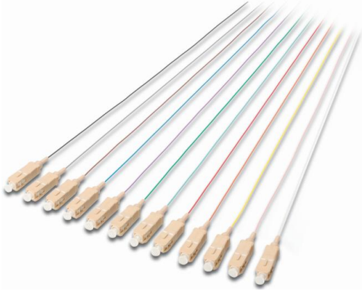
DK-25221-02 (SC Simplex, OM2)