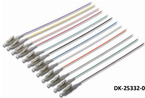
DK-25332-02 (LC Simplex, OM2)